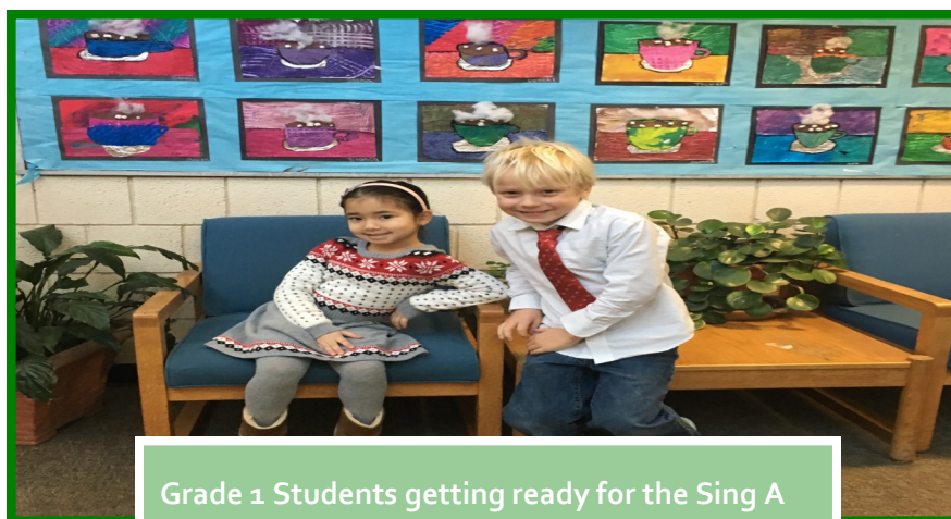
Grade 1 Students getting ready for the Sing A Long