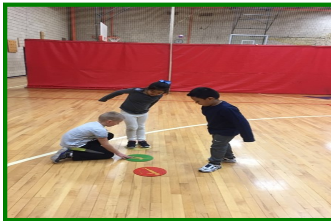
See my kindergarten students enjoying the game called Frog Crossing

The month of February was devoted to our unit, Games. From Noodle Tag to Frog Crossing and Cookie Monster Tag to Catch and Chase, my students loved the challenge of learning and playing new games.