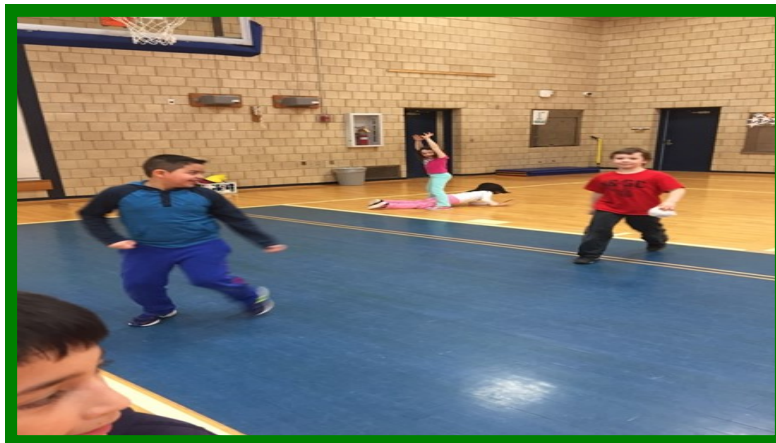
My second grade students' playing a tag game

Before beginning our unit, we spent time discussing the importance of being a good sport and what that looks and sounds like in the gym. My main goal in this unit is for my students to learn about the skill of sportsmanship and to have many opportunities practicing being a good sport. Thank you for all that you do at home to help instill the skill of sportsmanship in your child! Thank you for your continued support in helping your child come prepared to PE in comfortable clothing and sneakers.