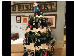
Tribute to Mr. Rogers