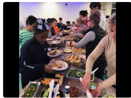
Grade 3 Thanksgiving Celebration